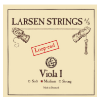
A Medium Loop

‘A golden, open and clear tone with a nice balance of warmth and brilliance.’