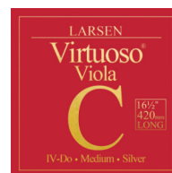
C Extra Long